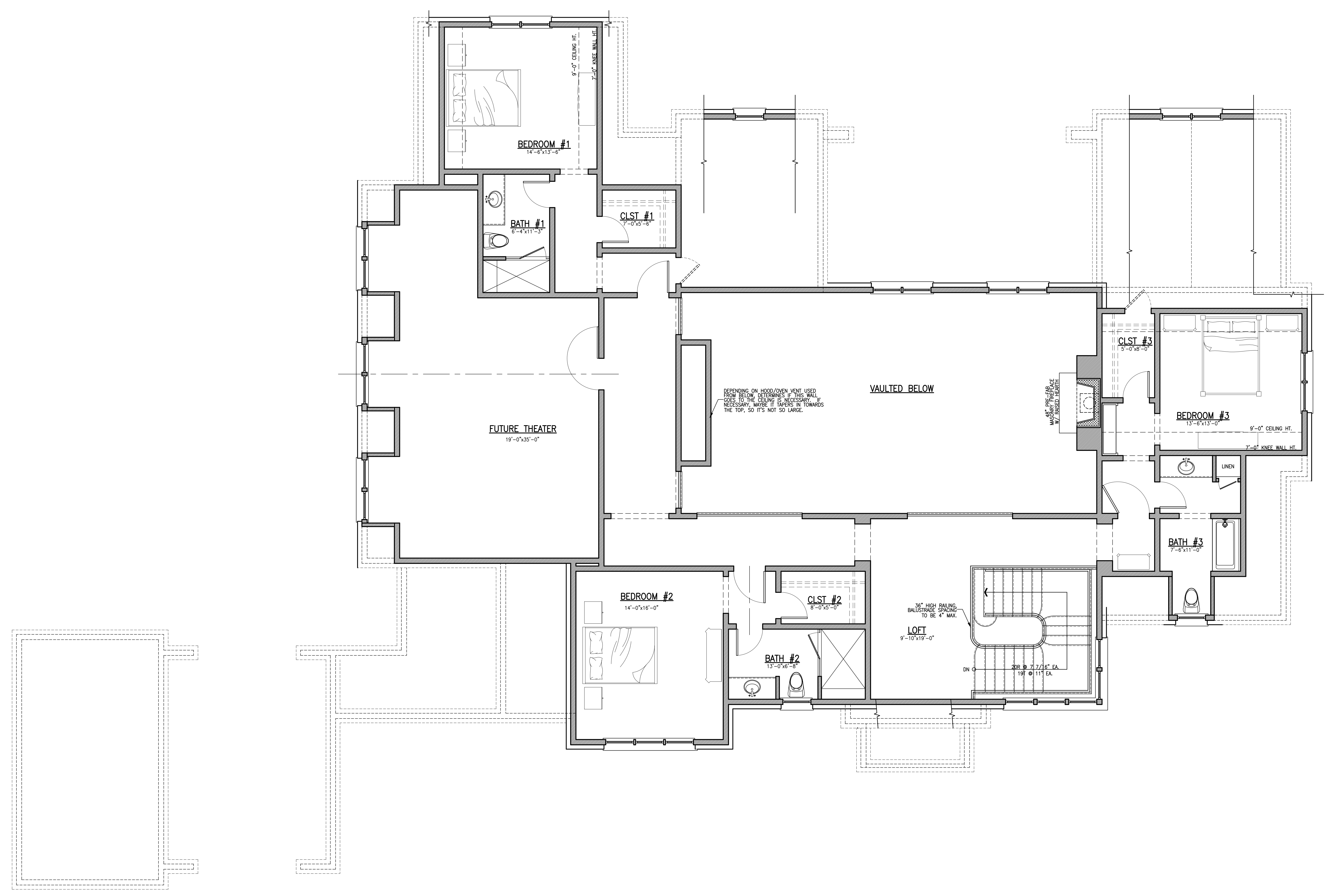
1 A-2.420 UPPER LEVEL FLOOR PLAN SCALE: 1/4" = 1'-0"