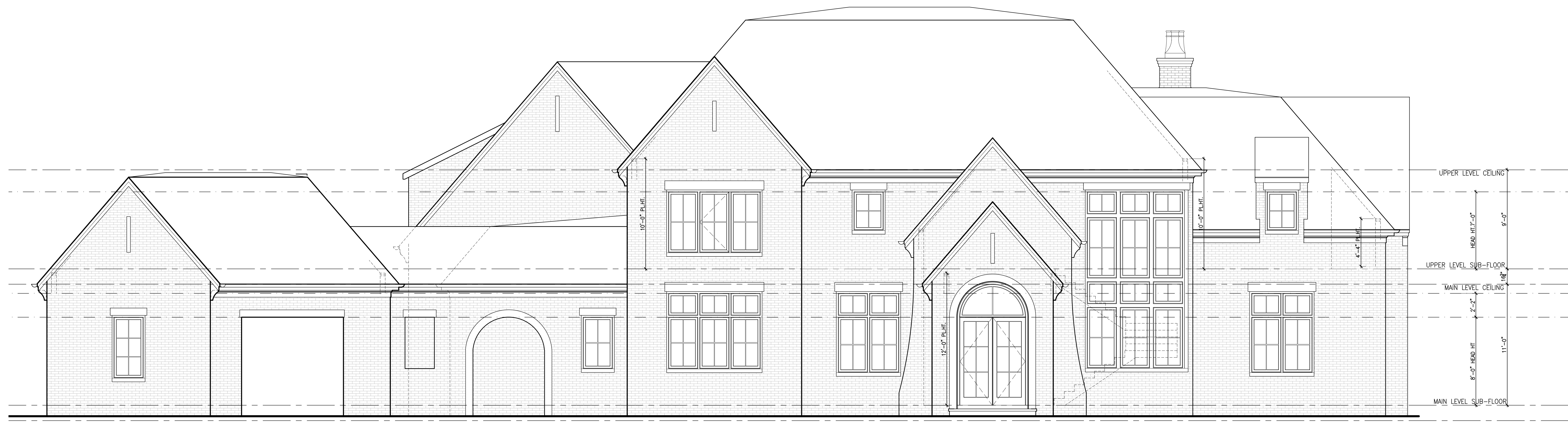
1 FRONT ELEVATION A-3.000 SCALE: 1/4" = 1'-0"

EATON RESIDENCE LYNDON CREEK; LOT #5 MILTON, GA 30004