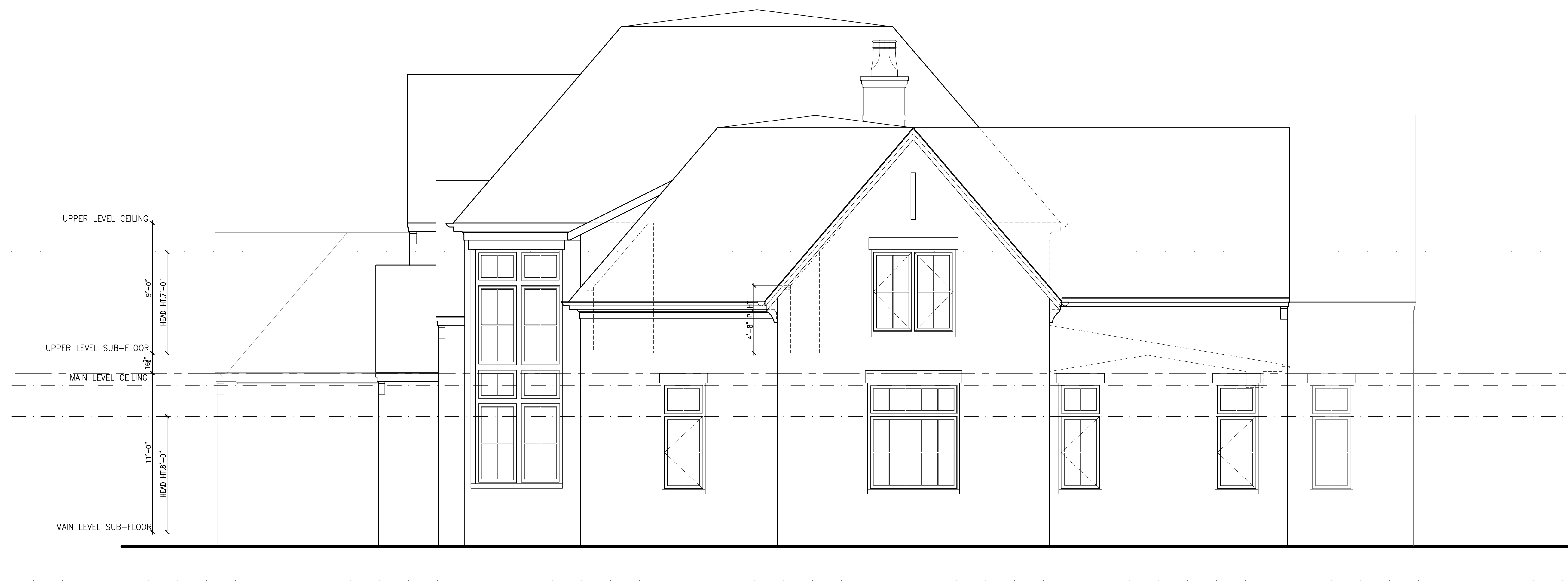
2 RIGHT ELEVATION A-3.000 SCALE: 1/4" = 1'-0"