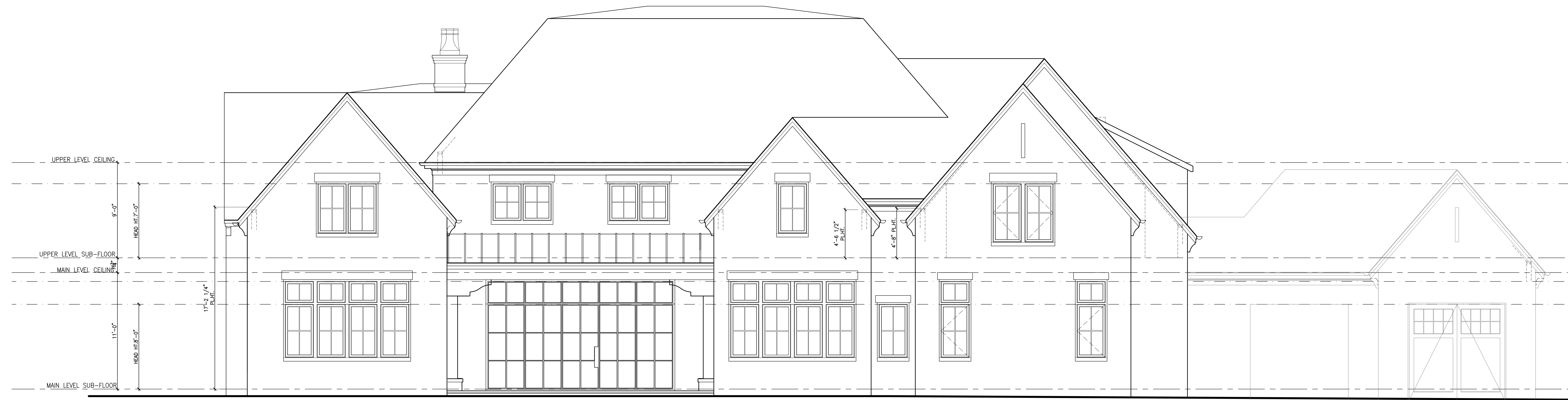
1 REAR ELEVATION A-3.001 SCALE: 1/4" = 1'-0"

EATON RESIDENCE LYNDON CREEK; LOT #5 MILTON, GA 30004