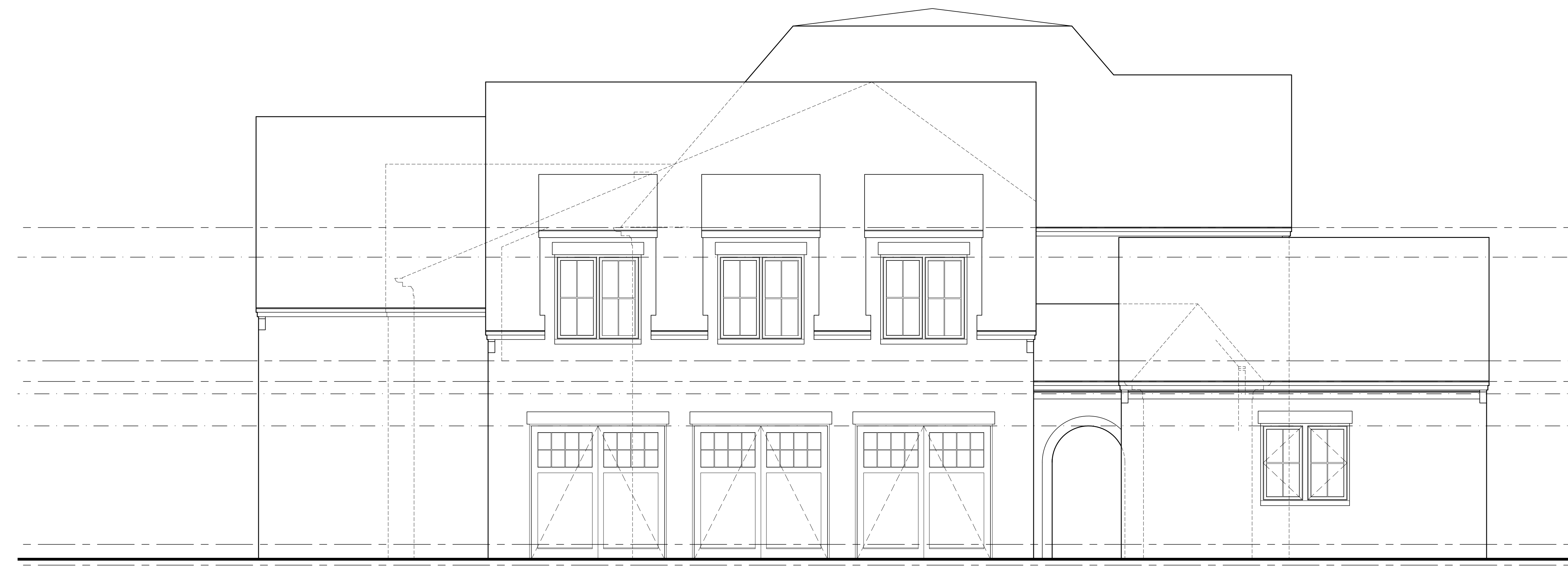
1 REAR ELEVATION A-3.001 SCALE: 1/4" = 1'-0"